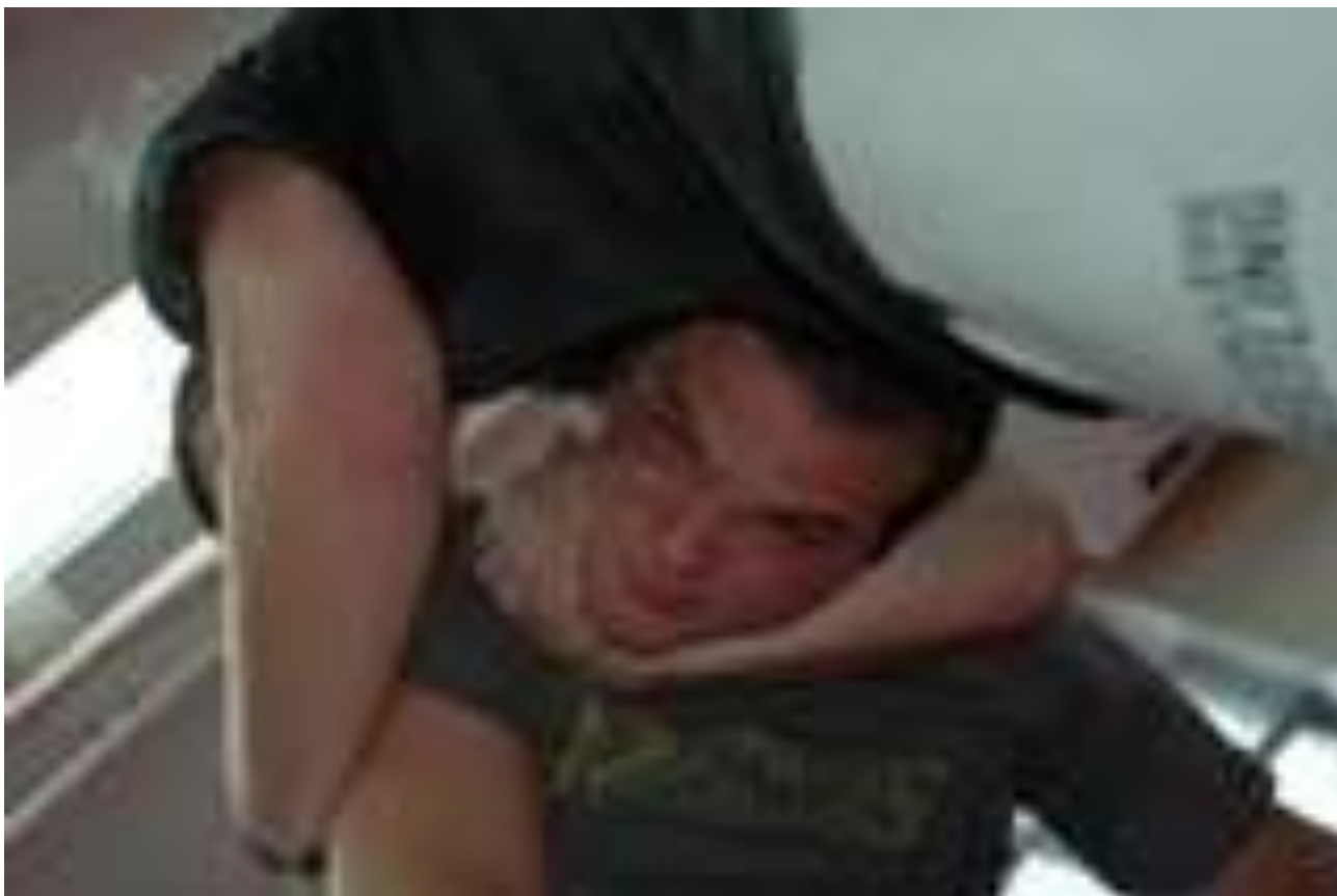
Anaconda Choke 2